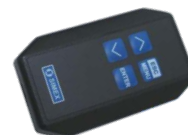
IR remote controller SIR-15