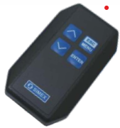
IR remote controller SIR-15

Remote controller is not a part of the device and is available on request as optional accessory.